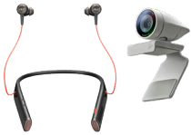
VOYAGER 6200 UC/ POLY STUDIO P5