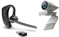
VOYAGER 5200 UC/ POLY STUDIO P5