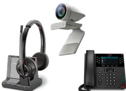
SAVI 8200 OFFICE SERIES/ POLY STUDIO P5/VVX 450