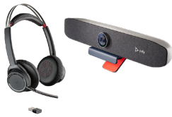
VOYAGER FOCUS UC/ POLY STUDIO 15