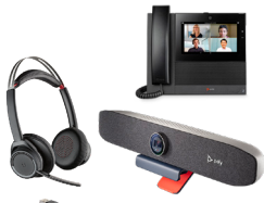
VOYAGER FOCUS UC/ POLY STUDIO P15/CCX 700