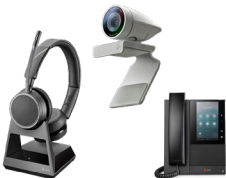
VOYAGER 4200 UC SERIES/ POLY STUDIO P5/VVX 500